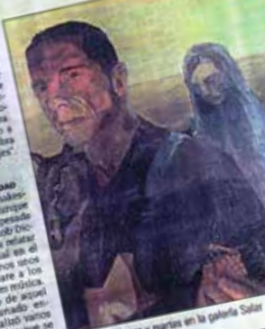
The Raven, lunes y martes en la galería Salar

Este lunes y martes, a las 21.30 en la galería Salar