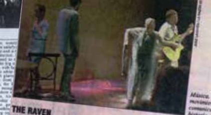
El cuervo, las sombras que cobijan la soledad

El cuervo is a powerful and evocative piece that explores the themes of mortality and the fragility of human existence.