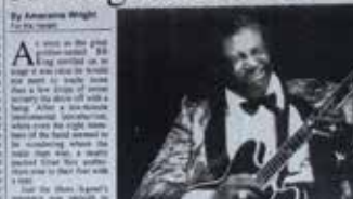
A king's comeback

A king's comeback is a powerful and evocative piece that explores the themes of mortality and the fragility of human existence.